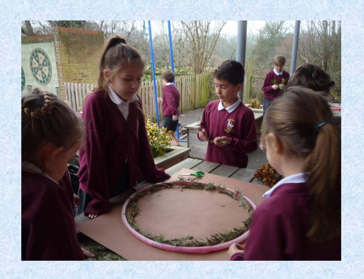
Wednesday 11<sup>th</sup> July